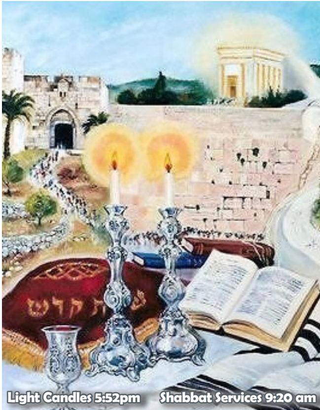
Light Candles 5:52pm Shabbat Services 9:20 am